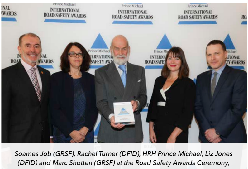
Dec 12, 2017

On December 12, 2017 and in the presence of 400 road safety delegates and industry leaders, Prince Michael of Kent awarded the GRSF with his prestigious International Road Safety Management Award. The award recognized GRSF's impressive track record of implementing interventions in LMICs that effectively integrate the various aspects of road safety management, including road and vehicle safety standards, crash data analysis, agency development, and police enforcement.